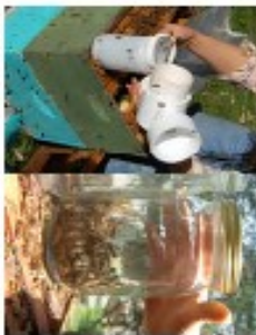
8. Once the bees are measured, you can use powdered sugar to dislodge the mites. First, dump the 300 bees into a jar with a size 8 hardware mesh cover.