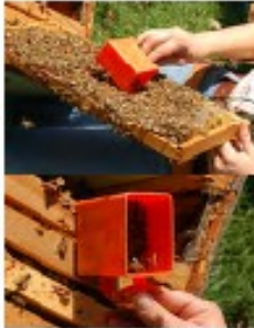
5. Method 2: If your cup is rectangular, run the cup gently down the backs of the bees, chasing them to funnel into the cup. Flip the cup on a hard surface to be sure the volume of bees is at the marked line.