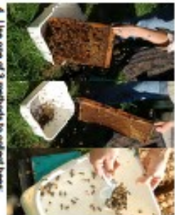
4. Use one of 3 methods to collect bees. Method 1: Rap a brood frame into a wash-bin bucket. Use your cup to scoop out 300 bees. Rap cup on a hard surface to be sure the bees are at the marked line. Add or subtract bees as needed.