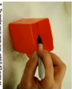
3. To make your own cup, add 0.42 cups or 100 ml of water to a cup. Mark a line at the water. 0.42 cups = 1/3 cup + 1 tsp + 1 1/4 tsp.