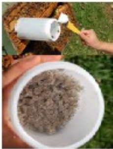
9. Add about 2 Tbsp (one flat scoop) of powdered sugar. Add more sugar if the bees are not coated in white. Let the bees set for at least one minute in the shade. Don't hurry this!