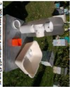
2. 300 bees occupy a volume of 0.42 cup or 100 ml. Be careful! Bees are small, so small changes in volume leads to large changes in the number of bees (i.e. 0.38 cup = 200 bees, and 0.5 cup = 400 bees).