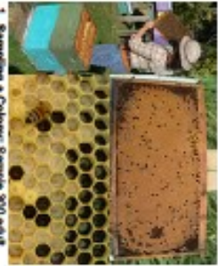
1. Sampling a Colony- Sample 300 adult bees from one frame containing brood (eggs, larvae or pupae).

WHY SAMPLE in a standard way? -Be informed: know thy enemy -Decrease use of miticides -Reduce chemical residues in hive -Save time and money -Develop regional treatment thresholds -Breed queens from colonies with low mites