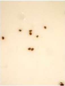
11. Add enough water to the dish to dissolve the sugar. Count the mites. This is mites per 300 bees. The mites will be irregular-shaped reddish-brown ovals. You can sometimes see their legs sticking.