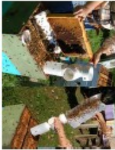
6. Method 3: Use the device called "Gizmo" to sample. It is available from the Walker T Kelly Beekeeping Company or you can build it using the plans online ( www.beelab.umn.edu ).