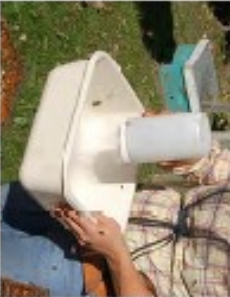
10. Shake the jar into a white dish for one minute to dislodge mites from bees. Shake HARD. It is important to remove as many mites as possible. Replace the sugar-coated bees in the colony where they will be cleaned.