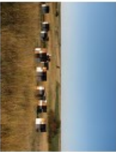
12. Sampling an Apiary- Sample a total of eight colonies using any one of the methods described above. Sample every fifth colony - loop back if need be.

> The standard number for mites in the colony is the number mites per 100 adult bees (if mites/100 adult bees). > If you know how many bees were in your sample, you can calculate the number of mites per 100 bees. > If you sample 300 bees, you just divide by 3. For example, if there are 12 mites in your sample, then there are 4 mites per 100 bees. > For other amounts of bees in the sample use this formula: \# \text{ mites}/100 \text{ adult bees} = \frac{\# \text{ of mites in the sample}}{\# \text{ of bees in the sample}} \times 100 > For treatment options go to Beelab.umn.edu