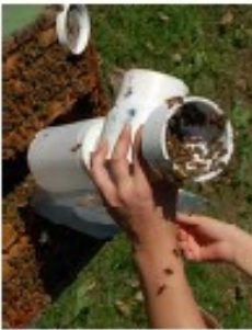
7. Gizmo has a volume built in to measure 300 bees. Out of the three methods, Gizmo is most accurate, but the other two methods can work as well if the bees are consistently at the marked line.