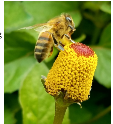
Toothache Plant.